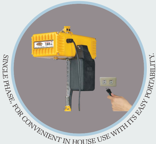
SINGLE PHASE, FOR CONVENIENT IN HOUSE USE WITH ITS EASY PORTABILITY.