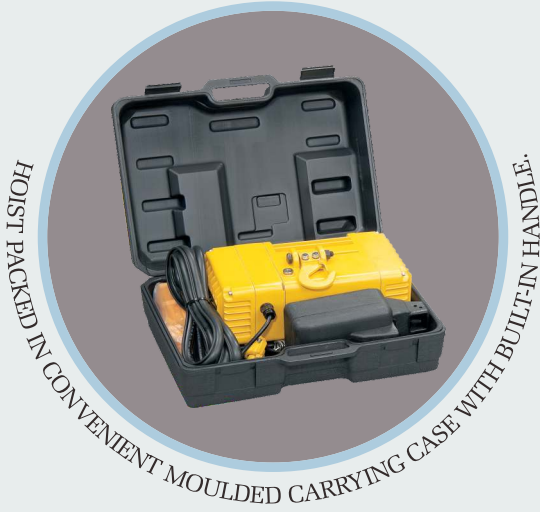
HOIST PACKED IN CONVENIENT MOULDED CARRYING CASE WITH BUILT IN HANDLE.